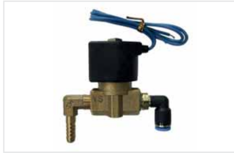
8. Assy-Solenoid Valve