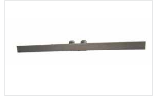
9. Solenoid Valve-Plate