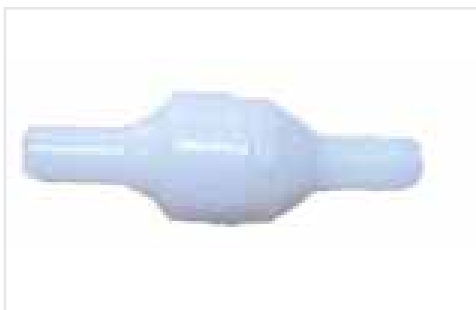
19. Check Valve