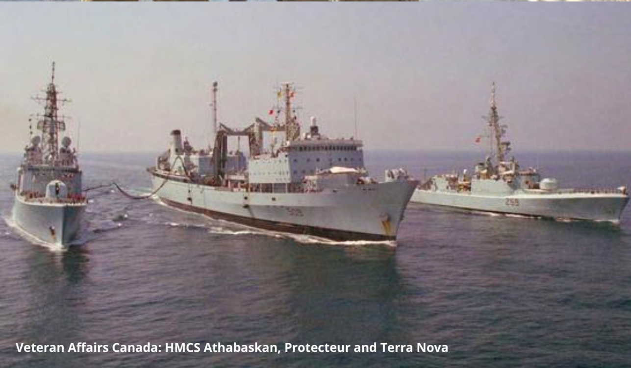
Veteran Affairs Canada: HMCS Athabaskan, Protecteur and Terra Nova