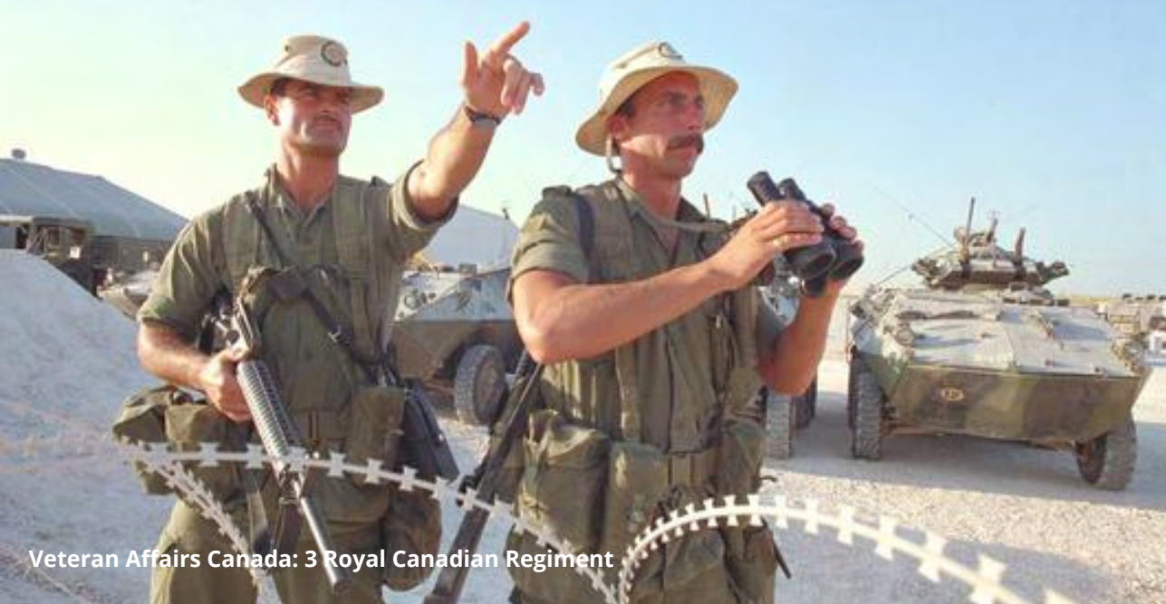
Veteran Affairs Canada: 3 Royal Canadian Regiment