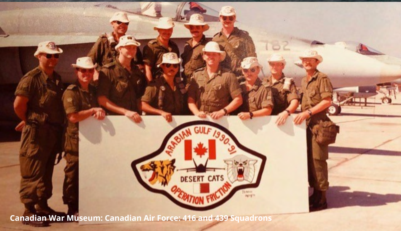
Canadian War Museum: Canadian Air Force: 416 and 439 Squadrons